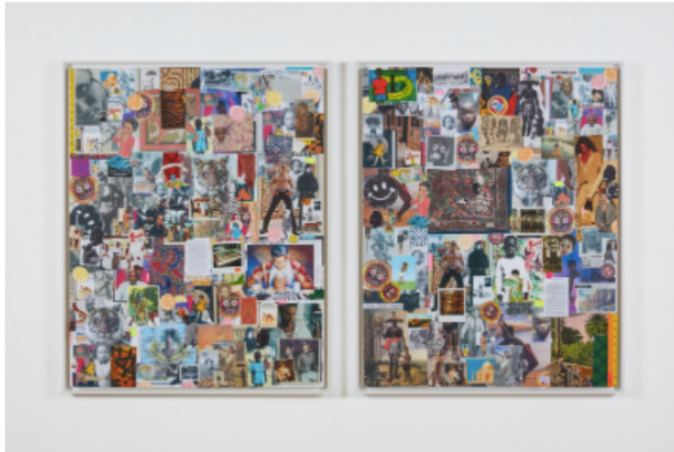
Sambo Schema 1 and 2, 2006 Mixed media on foamcore board 40 x 32 in. (101.6 x 81.3 cm) each Courtesy of the artist and Ortuzar Projects