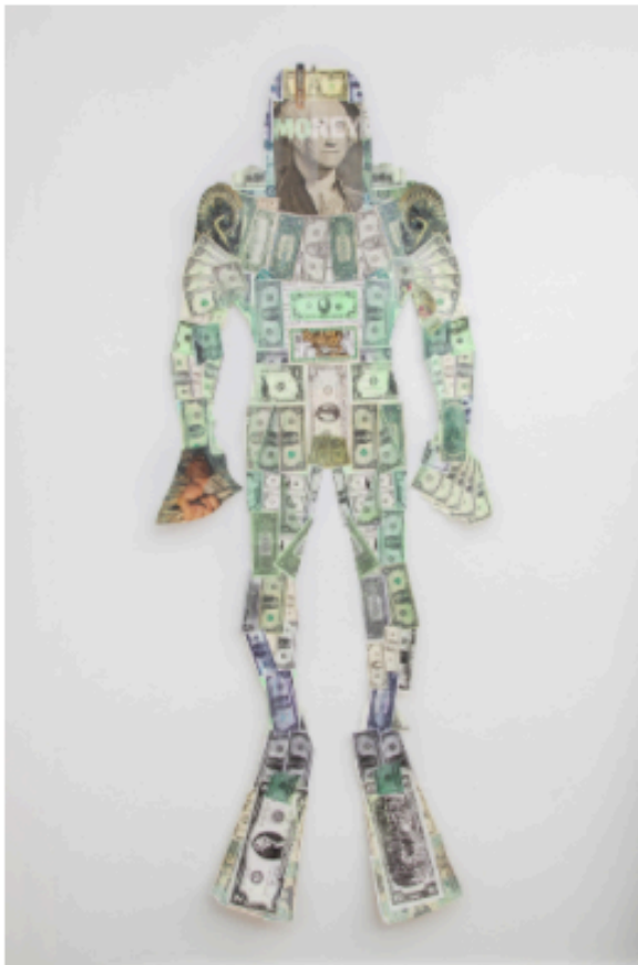
Money Man , 2017 Mixed media collage on paper 81 1/2 x 21 3/4 in. (207 x 55.2 cm)

The image of this man is repeated over and over into two rows, each original altered in some way. A KKK Hood painted on, a decapitated head. For a penis: an upside-down hooded bound body, long sharp knife, completed blacked out. The black male figure reduced to its most fetishized roles and fears, but with the ability to fight back. The first figure however on the top left, his face and torso are covered by a 2001 cartoon by Henri Arnold depicting a king on his throne, with a jester in front of him on his head exclaiming "The Slave who neither fears not wants us as good as the grandest king". A statement most likely uttered with relish by the kindest slave owner, and today's racist bigot. Another stark reminder of the not-so-distant past, and the ever-so-horrifying present.