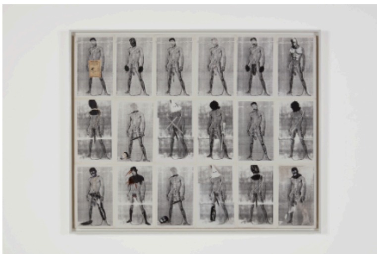
Nobly Nude (The Slave Master and the Master Slave) , c. 2000 Photocopy and mixed media collage on foamcore board 32 x 40 in. (81.3 x 101.6 cm)

The title of the work, the images, the theme, the man. It's impossible not to think of the long tumultuous history of African Americans and boxing, such as with legendary fighter Muhammad Ali (1942-2016). I can't help but also reflect on how this work, in particular, emphasizes the struggles that every gay black man has historically had to face. A struggle that I have no way of fully comprehending because of my age, race, and gender. But that doesn't mean I cannot recognize and acknowledge it when I see it and ask myself what can I do to make this kind of thinking change?