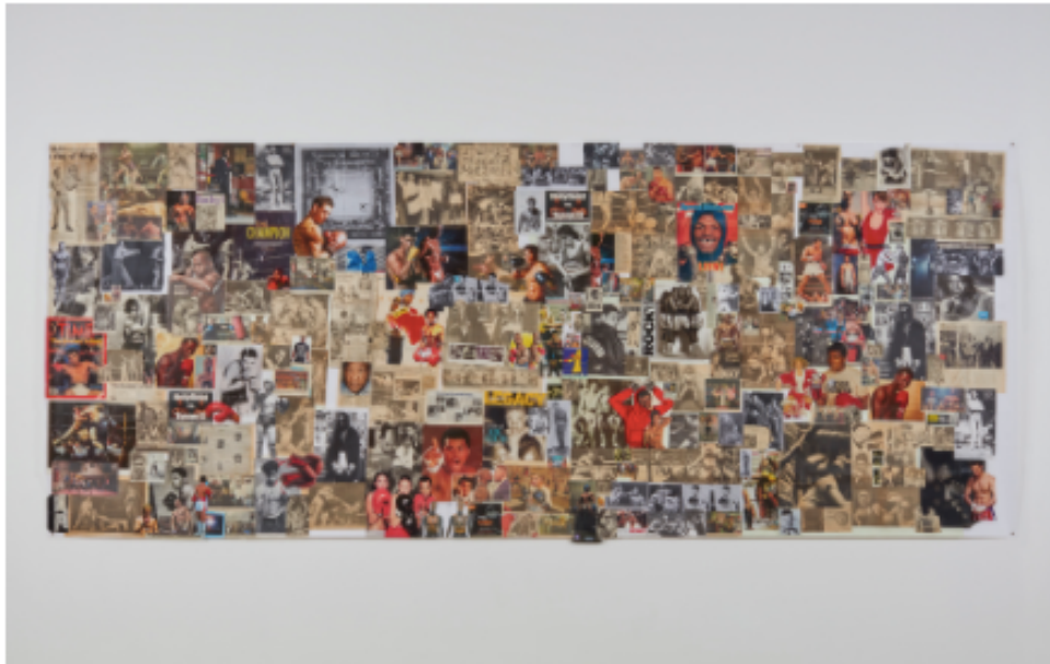
Boxers (for Emile Griffith) , 2020 Mixed media collage on paper 53 x 132 in. (134.6 x 335.3 cm)

It's massive and you get lost while looking at it. Where to begin with your eyes? Where does it begin? Images of men fighting, boxing, prancing with victory, pummeled with defeat, a last portrait for the obituary. The story of this work can be seen in many ways, but knowing the history it's hard not to think of Emile Griffith's (1938–2013) infamous 1962 boxing match with Benny Paret [7] , where during the weigh-in Paret called Griffith a gay slur, leading to a heated match resulting in Paret being knocked out and dying in a coma.