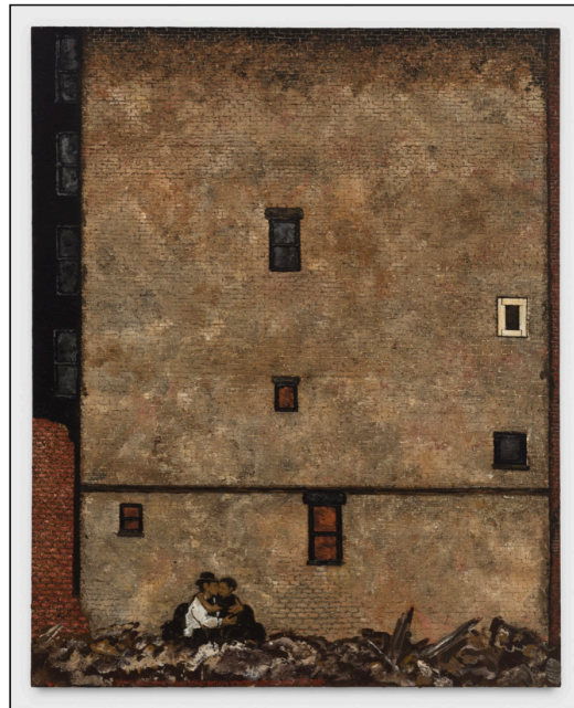
Martin Wong, "Sharp & Dottie," 1984, acrylic on canvas, 60 x 48 inches.